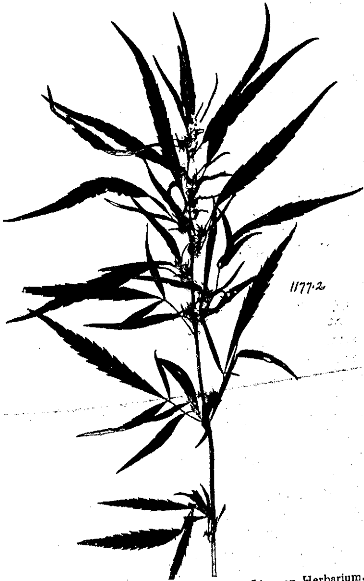
Specimen No. 1177.2 of Cannabis in the Linnean Herbarium.