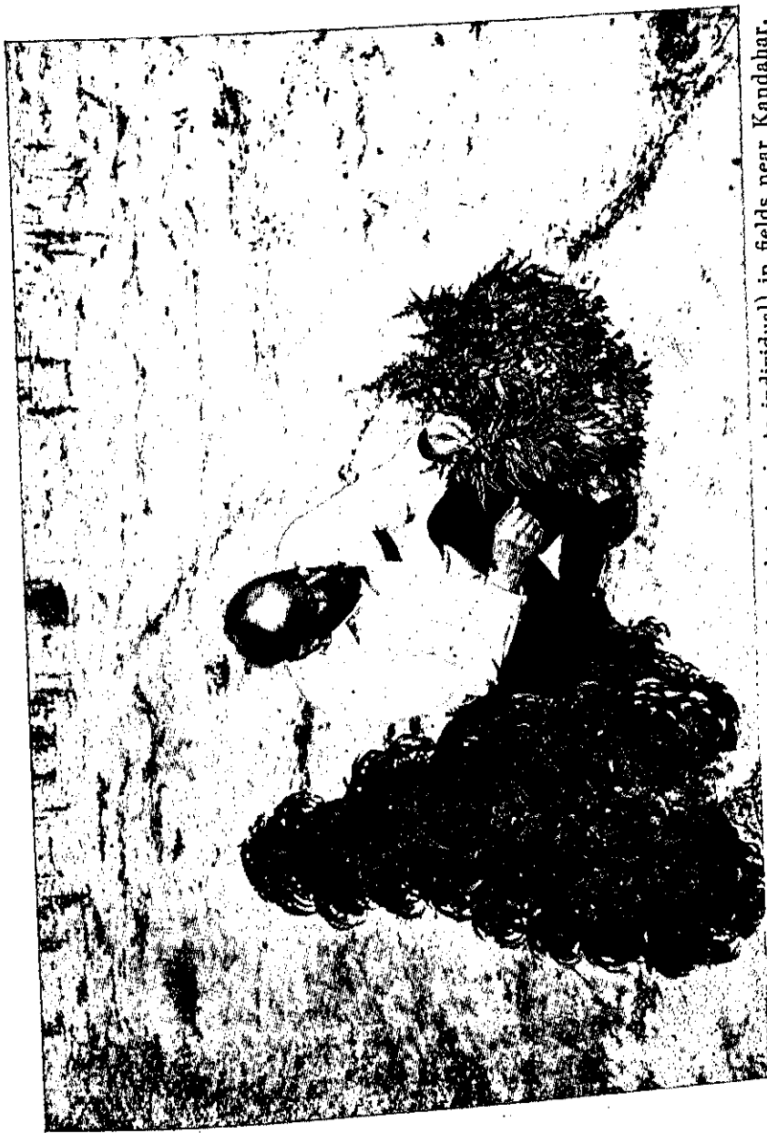
Cannabis indica (left: pistillate individual; right: staminate individual) in fields near Kandahar, Afghanistan. Pistillate plant: source of specimen R. E. Schultes 26505 (Econ. Herb. Oakes Ames).