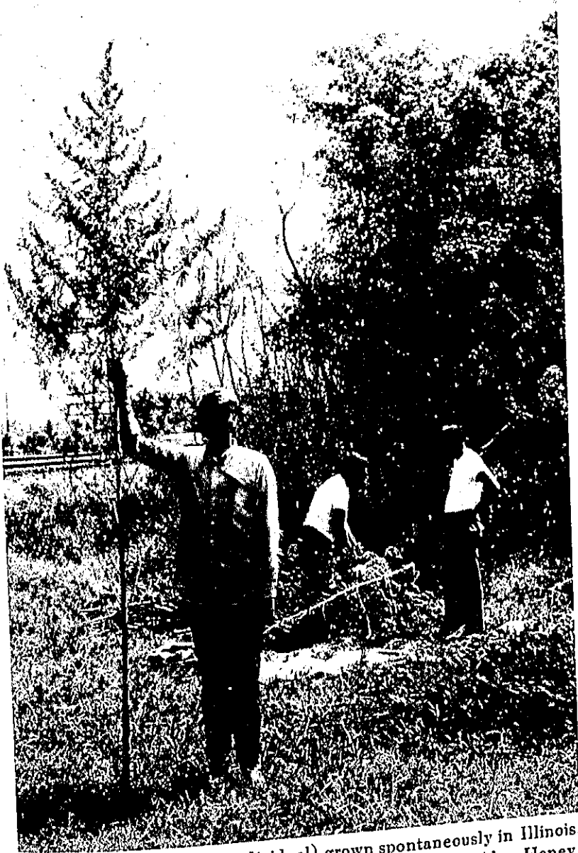
Cannabis sativa (pistillate individual) grown spontaneously in Illinois.