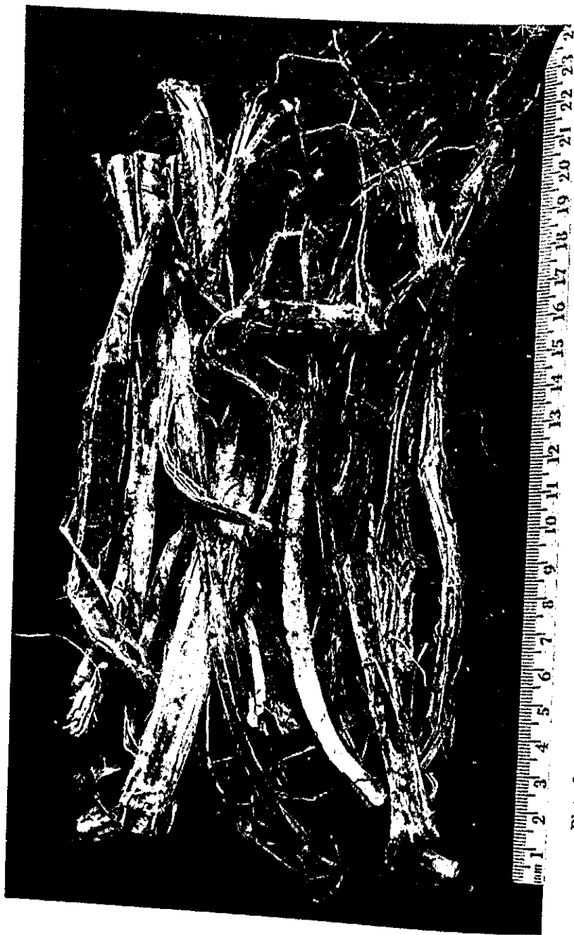
Plate 5. Chamaïro bark as sold in market in Tingo Maria, Huánuco, Peru (Plowman 7608).