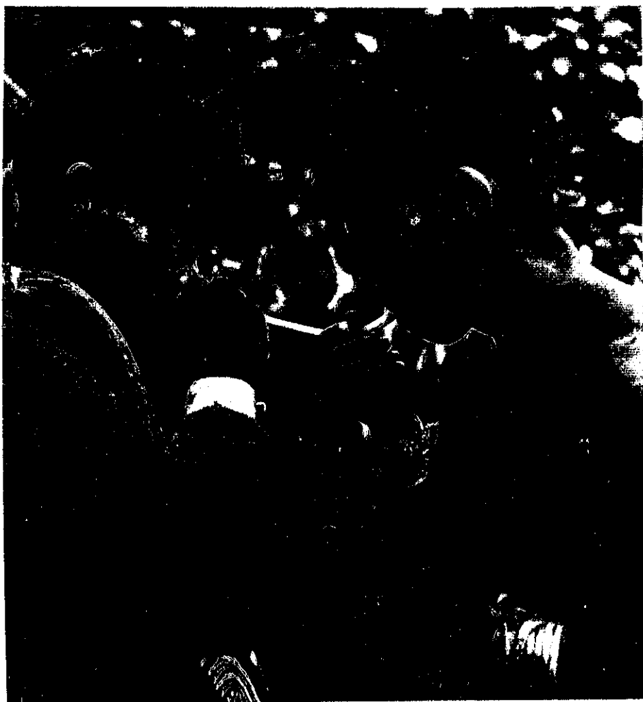
FIG. 1.—Use of the straight bird-bone snuffing-tube for administration of the tobacco-coca snuff of the Yukuna Indians, Río Miritiparaná, Amazonas, Colombia.

Of possible significance is the curious fact that Anadenanthera peregrina is or has been employed not only in northern South America but probably in the Antilles as well. Tobacco snuffing was a well established custom in the West Indian islands long before the arrival of Europeans, and the snuffing in Hispaniola of a narcotic, vision-producing powder called cohoba was no cause for intellectual curiosity, since most early writers assumed that cohoba was merely another tobacco snuff. It was the American ethnobotanist Safford who first identified, quite correctly, I believe, the West Indian cohoba snuff with the yopo of the Orinoco basin of Venezuela and Colombia (16).