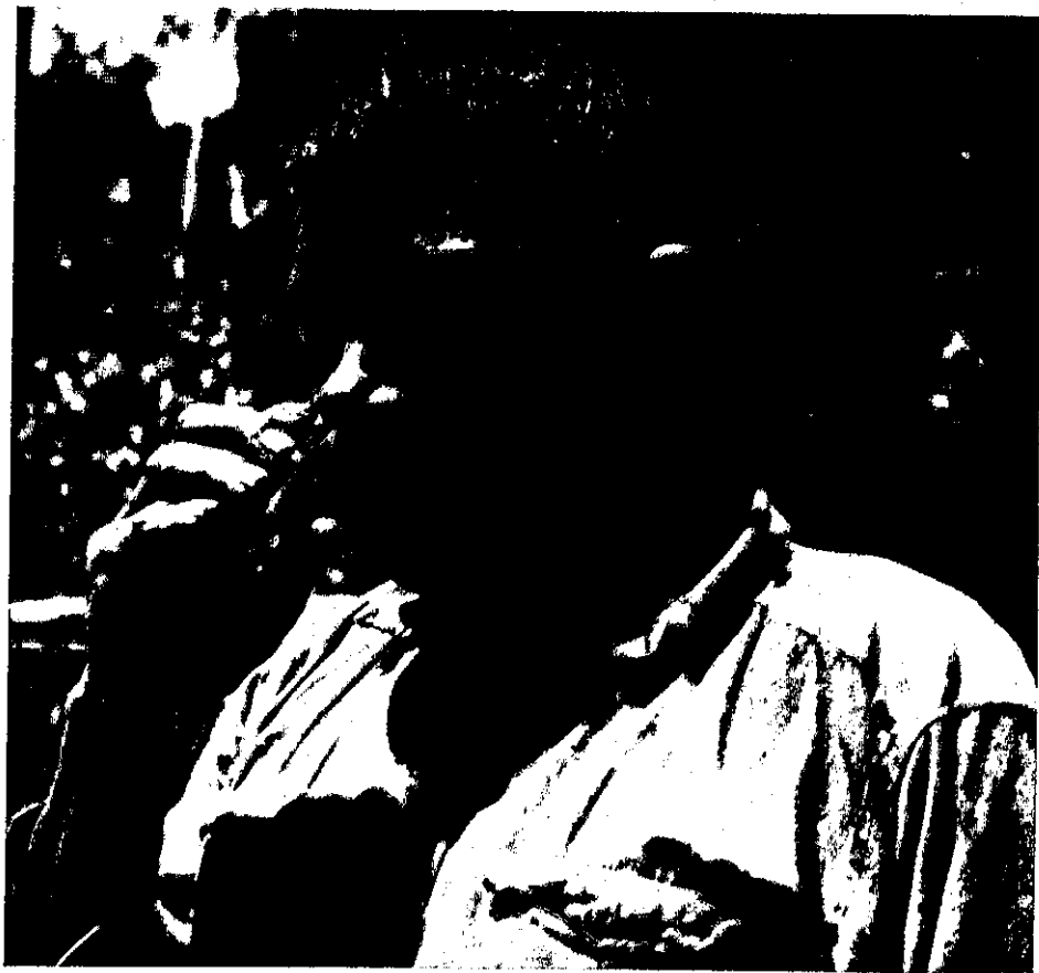
FIG. 2.—Tanimuka Indian administering tobacco-coca snuff with the V-shaped bird-bone snuffing tube employed for self-administration. Río Miritiparaná, Amazonas, Colombia.

of Amazonian snuffs to various leguminous trees, and it was Bentham who "came to the conclusion that all South American trees . . . referred to as the source of narcotic snuff were probably one species and were identical with Linnaeus' Mimosa peregrina , which was first described in 1737 from a seedling growing in the celebrated Clifford Garden in Holland" (16). It seems that one of the most extraordinarily mistaken generalisations in ethnobotany—that all of the narcotic snuffs of the Amazon that were not obviously tobacco must have been prepared from Anadenanthera peregrina —has stemmed from Bentham's conclusions. This generalisation, of course, has not been without influence, judging from the state of confusion and lack of clarity encountered in many of the earliest reports of "smoking" and "snuffing." We have no clear distinction, in many early instances, as to whether tobacco or cohoba represented the plant the use of which was being described, since tobacco was snuffed in the Caribbean area at the time of the arrival of the Spaniards.