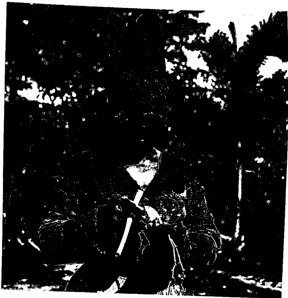
FIG. 3.—Yukuna Indian pouring out into the hand from a snail-shell case a quantity of tobacco-coca snuff for insertion into the bird-bone snuffing tube. Río Miritiparaná, Amazonas, Colombia.

A recently published map (4), showing the distribution of snuffs made from Anadenanthera , includes the entire Orinoco basin and adjacent areas of southern Venezuela to the east; westward across the northern Colombian Andes, much of the Magdalena Valley; down the Andes through Columbia, Ecuador, Peru and Bolivia; the coastal region of Peru, and scattered isolated areas in northern Argentina, and the central and western Amazon Valley. One must remember that this map refers not to one species but to a genus—and there have been suggestions that species other than Anadenanthera peregrina have entered the South American snuff making picture. Furthermore, one must recall that Cooper himself cautioned that "our tribal records on which the . . . distribution map . . . is based are probably very incomplete. On the other hand, some of the attributions may not be correct, since in some cases the lack of exact botanical identification makes