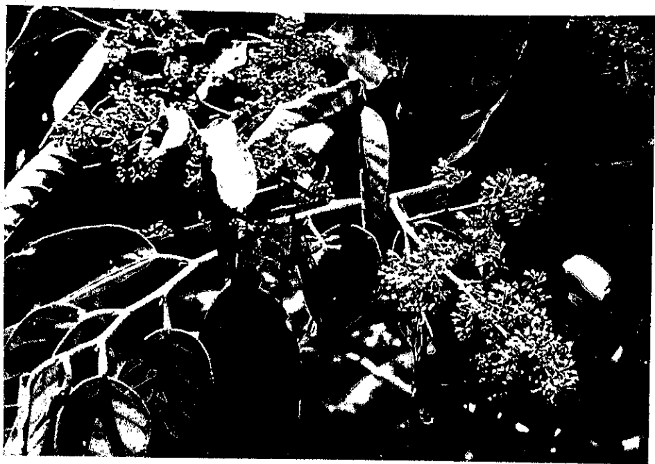
FIG. 5.—Leaves and flowers of Virola calophylloidea , one of the species of Virola from which a strongly hallucinogenic snuff is prepared. Mitú, Vaupés, Colombia.

After eight years of search, I discovered that yakee was prepared from several species of Virola , V. calophylla , V. calophylloidea and, perhaps, V. elongata of the Myristicaceae (17, 18). The natives strip bark from the trunks before the sun has risen high enough to heat up the forest. A blood-red resin oozes from the inner surface of the bark. It is scraped off with a machete or knife and boiled in an earthen pot for hours, until a thick paste is left. This paste is allowed to dry and is then pulverized, sifted through a fine cloth, and finally added to an equal amount of ashes of the stems of a wild cacao species. The ashes give the snuff consistency to withstand the excessive dampness of the air which might otherwise quickly "melt" the powdered resin-paste to a solid lump.