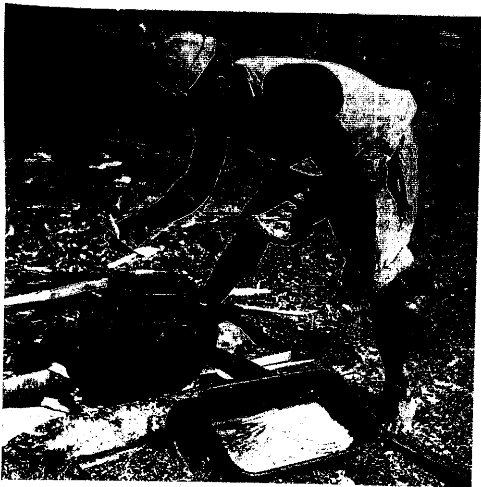
FIG. 6.—Puinave Indian preparing yakee-snuff from the red resinous exudate from the bark of Virola -trees. Río Apaporis, Vaupés, Colombia.