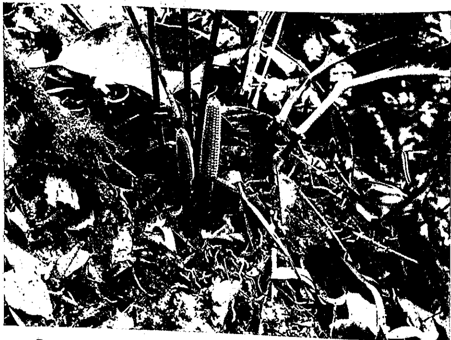
Basal portion of Zamia cupatiensis Ducke (Schultes et Cabrera 17663). Cerro de La Pedrera, Río Caquetá, Comisaría del Amazonas, Colombia.