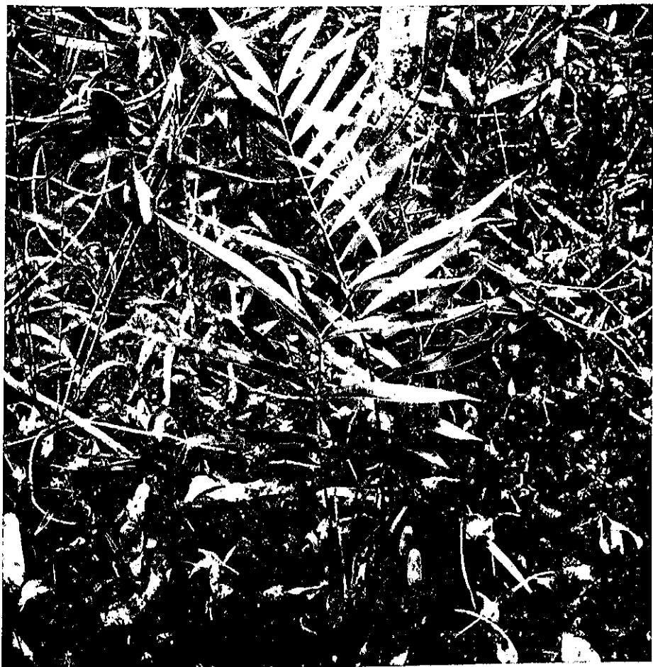
Habit of Zamia jirijirimensis R. E. Schultes (Schultes 12101). Raudal de Jirijirimo, Río Apaporis, Comisaría del Amazonas, Colombia.