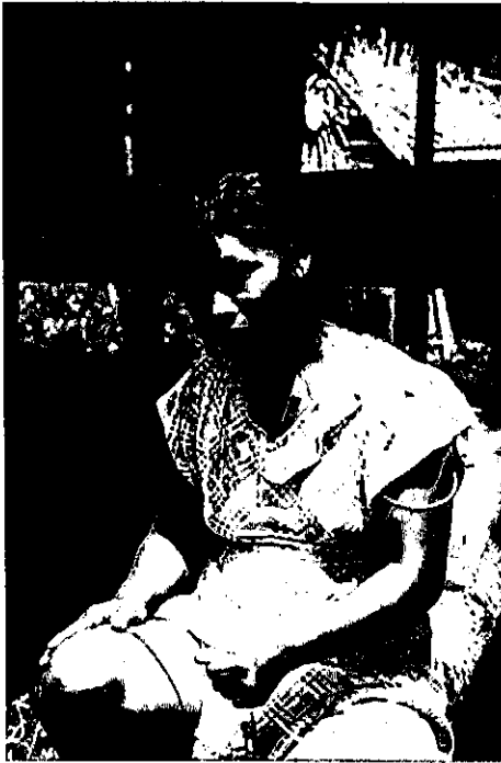
5. An Indian woman twisting chambira fiber of Astrocaryum vulgare into twine, Río Apaporis, Vaupés, Colombia.

saponification is 220.2. The seed oil, solid at ordinary temperatures, has a slightly higher initial melting point (30° C), a higher saponification index (240-245), and much lower iodine index (12-14). These two oils are admirably suited for use in the soap industries (5).