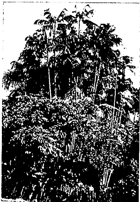
7. A clump of Euterpe oleracea on the outskirts of Mitú, Vaupés, Colombia.