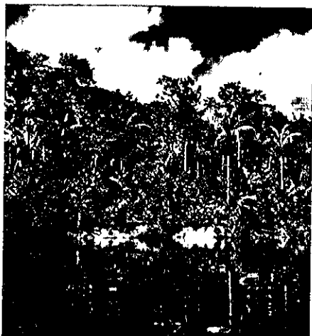
8. Euterpe precatoria along banks of the Río Caquetú, Amazonas, Colombia.