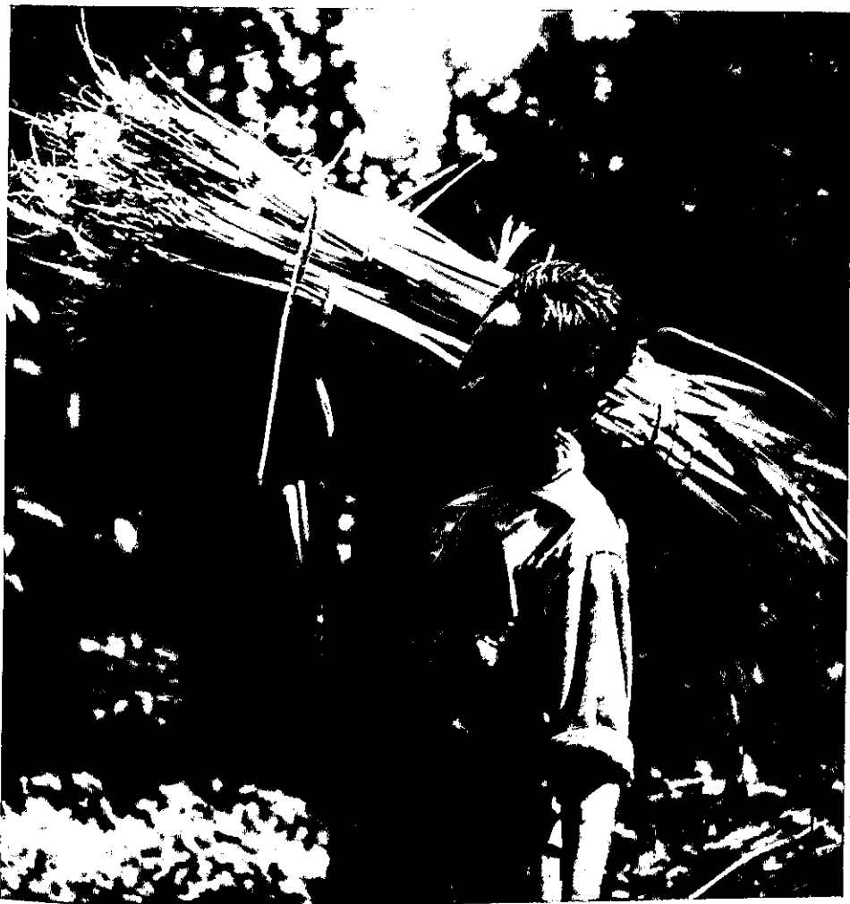
4. Bundles of young pinnac of Astrocaryum vulgare ready for extraction of fibers, Río Apaporis, Vaupés, Colombia.

ent be cultivated and where hand labor is available. There is a very real possibility that simple machinery could be developed for the extraction of cumare fiber. There exists, naturally, the same hope that the wise application of agronomical procedures might develop strains with fewer or no spines—for these are a major disadvantage present in all species of Astrocaryum .