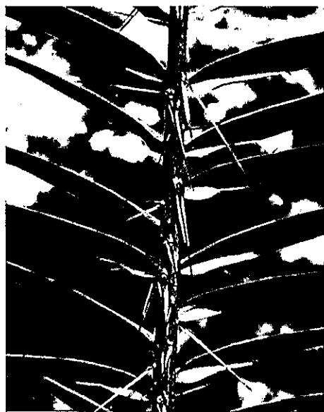
3. The spinous leaf of Astrocaryum vulgare , Vaupés, Colombia.

ticate. A principal disadvantage to commercialization in plantation form might be its spiny nature, but a search for spineless mutants and a program of selection undoubtedly could overcome this problem.