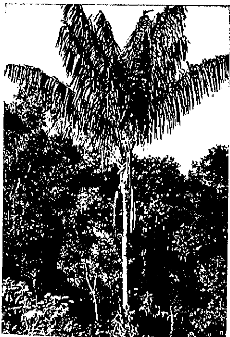
10. Oenocarpus bacaba growing in forest, Vaupés, Colombia.

have been recognized from tropical Americas. The species most commonly found in Amazonian Colombia is Mauritiella aculeata (HBK.) Burret. It is known in the Vaupés as caranaí .