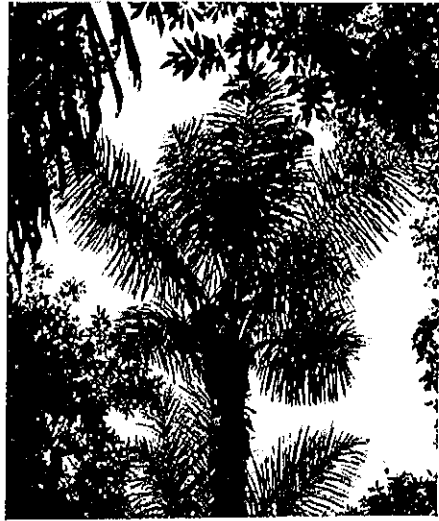
2. The crown of Astrocaryum vulgare , source of chambira fiber, on Río Apaporis, Vaupés, Colombia.

The yellowish-white fiber is extracted from the leaves by maceration in water. An interesting description of the preparation by Siona Indians of the Colombian Amazon of chambira fiber states that both men and women gather the immature leaves. "The woman prepares the fiber from the palm heart, which consists of 20 to 40 blades about two to three feet long. The blade, three quarters of an inch wide at the base, tapers to a point at the other end. Start-