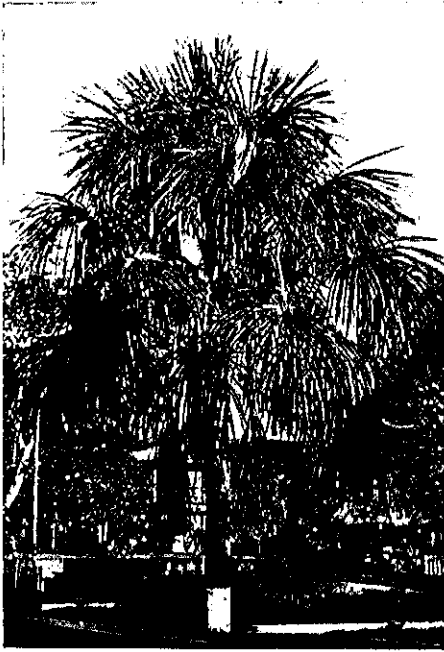
9. Mauritia flexuosa growing in the center of the town of Mitú, Vaupés, Colombia.

and render it more important as a potential domesticate, especially for ecological sites not usable for other cultigens.