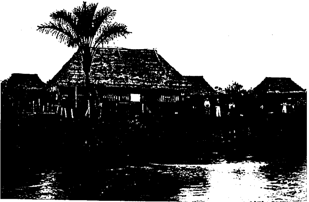
1. Astrocaryum murumuru on the Río Putumayo, Amazonas, Colombia.

would seem to indicate the wisdom of a search for strains less fiercely armed with spines. Indians have informed me of "sports" with unarmed stems, and I have found in the Amazon several cultivated strains of the pupunha or chontaduro palm, Bactris gasipaes HBK. [ Guillielma gasipaes (HBK.) L. H. Bailey], the trunks of which are devoid of spines. What we must do in our search for new economic plants is to examine nature—to see what nature itself has accomplished that we may bend to economic advantage.